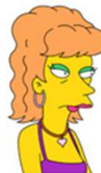
JS Comm. I. Inglese