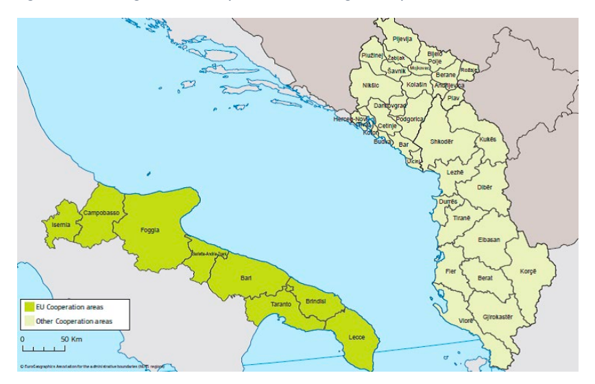
Figure 1 -IPA II Program - CBC Italy-Albania-Montenegro - Cooperation area

In January 2021, t33 has been commissioned by ARTI, Agenzia Regionale per la Tecnologia e l'Innovazione of Puglia Region, to perform the ongoing evaluation of the Programme. The present report, that is an additional product not explicitly included in the Technical Offer, provides a preliminary analysis of the small-scale projects financed under the targeted call of the Interreg Italy-Albania-Montenegro 2014-2020.