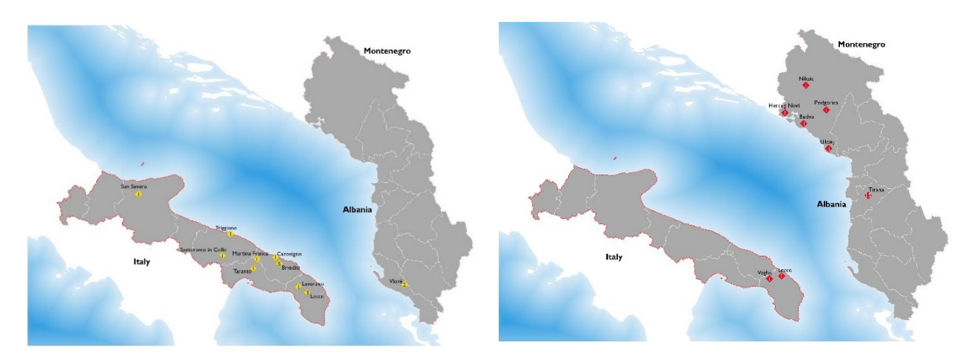
Map I Geographical distribution of lead partners (left panel) and project partners (right panel)