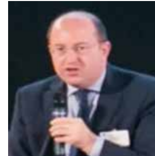
Mr. Alain Baron EU Commission, DG Mobility and Transport (DG MOVE)

Mr. Baron presented the Corridor VIII from a political point of view, where there must be not only infrastructure projects, but a real corridor, where infrastructure, transport, people mobility can work together in a modern governance system. The expectation is that the stakeholders of this corridor get closer to the EU policy making, in order to make our corridor and our needs more visible, so that the project can be more mature and easily clarified.